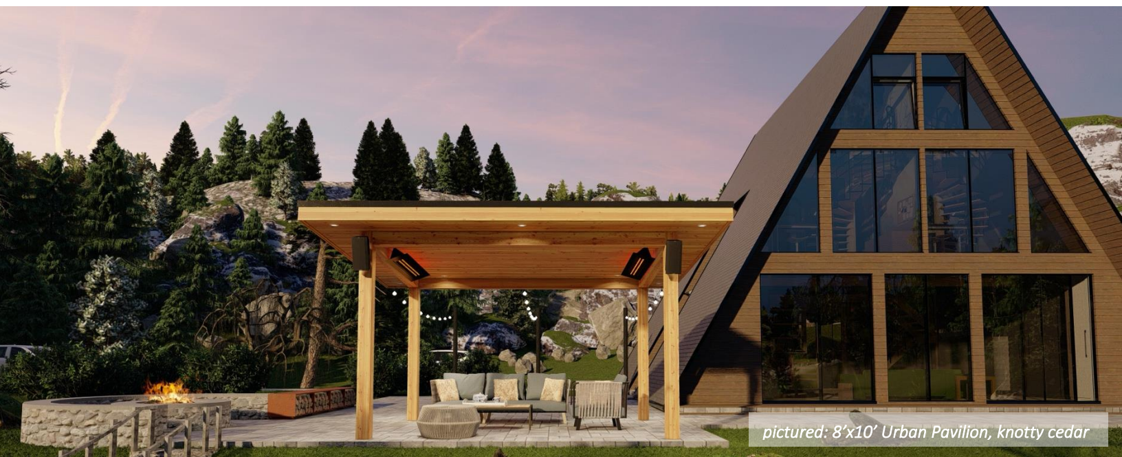
pictured: 8'x10' Urban Pavilion, knotty cedar