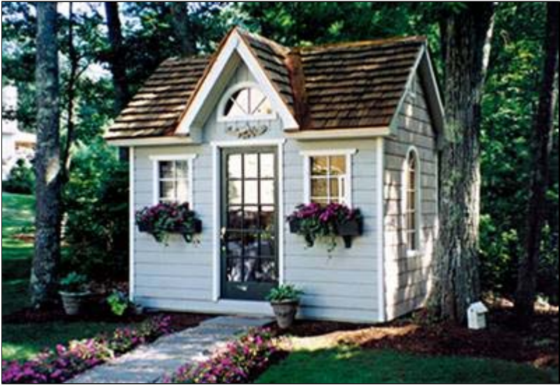
Summerwood Products / Summerwood Products

A Boxwood, Mass. fa installed this 8-foot from Summerwood P calls "the kissing she hang out in their ba